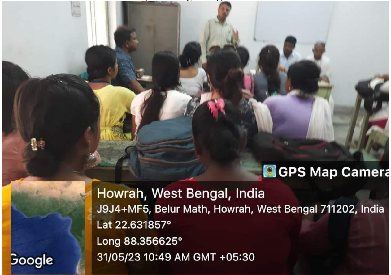
Figure 4: Students listening about traits in Jana Sikhon Kendra.

It was hot and sultry morning and students are observing each trait with patience. The mentor and instructor of various traits had given explanation and students of various traits show their practical knowledge in various traits. The students show enthusiasm and asked various queries regarding traits.