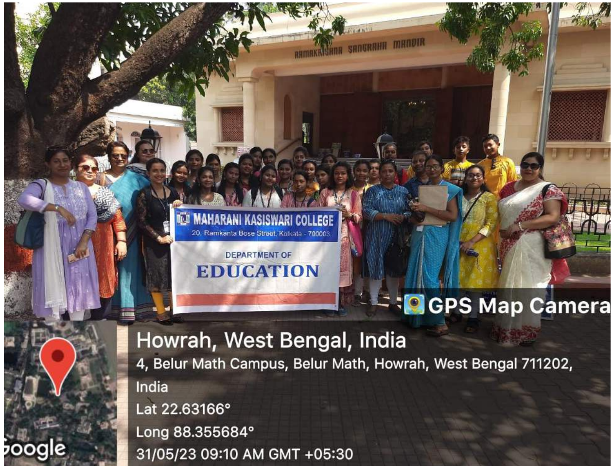
Figure 1: Students and Faculties in front of Ramakrishna Museum

A museum which had several articles related to Sri Ramakrishna and his disciples were stored. Then as earlier decided we all went inside and meet monk in charge and he had given free coupons to museum and token of prasada and little prasada to take home as blessings of almighty.