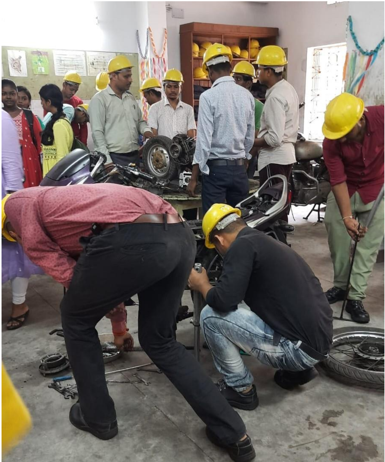
Figure 3: Students observing ongoing trait hand on practice in Jana Sikhon Kendra.

The traits are two wheeler repairing, television, computer ,LCD repairing, welding, A.C. repairing and various brands of mobile repairing.