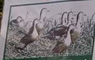
Lesser Whistling Duck