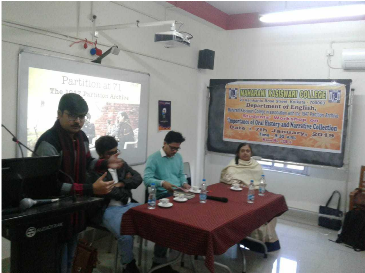
PHOTOGRAPH SHOWING THE DELIVERY OF THE LECTURE