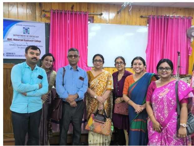
Figure 4 Speakers and Dignitaries