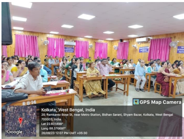
Figure 3 Audience